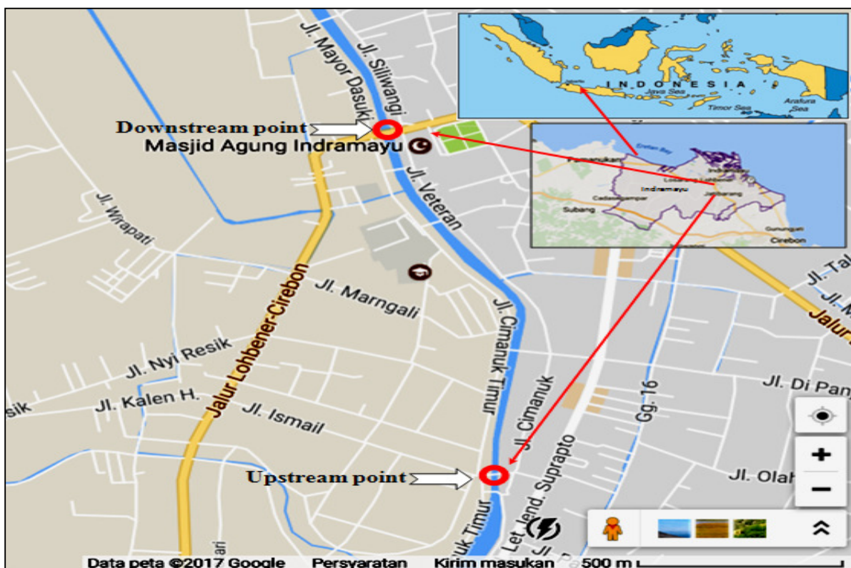
Fig.-1: Sampling Locations.

Water samplings were conducted 3 times at each point. Measurements conducted in the field are measurement of river discharge, temperature, pH and DO. River discharge was determined by several measurements, including river depth, width and flow velocity.